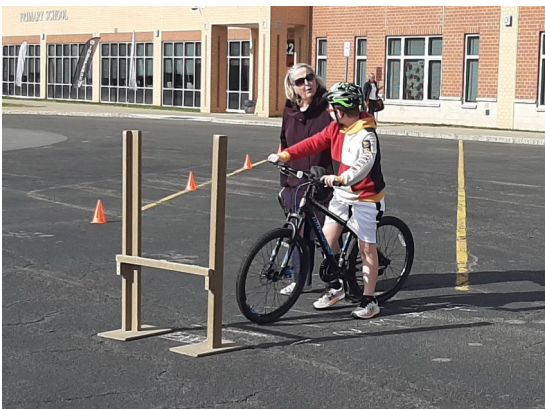
Fun at the 4th grade Bike Rodeo on a sunny and crisp Wed. Oct. 11 at the Midlakes Elementary School.