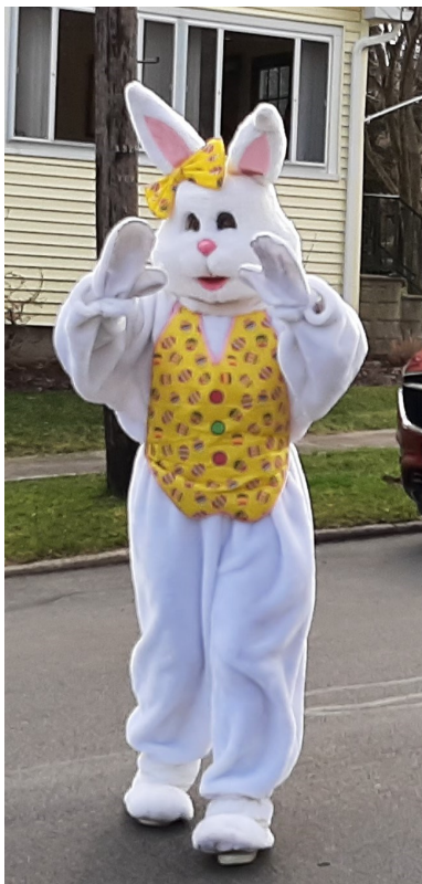
The Rotary Easter Bunny delivered both adult and children’s Easter Baskets on Good Friday.

Registration Deadline is April 14, 2023. They need to know the number of attendees for the breakfast count as well as to help determine space needs.