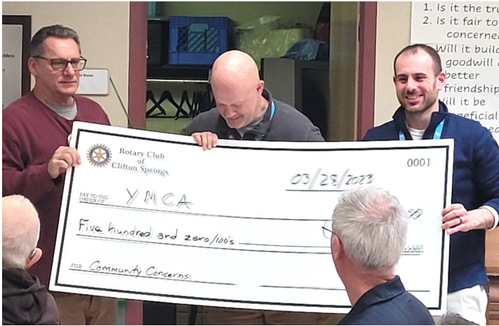
Presentation of a $500 check to the YMCA