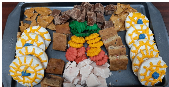
Christmas Cookies courtesy of Miss Lily Shaw (note the Rotary wheel). Thanks Lily!